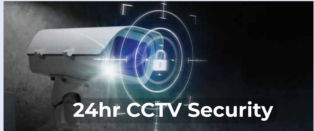
24hr CCTV Security