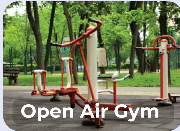
Open Air Gym