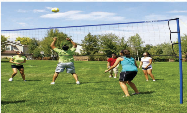
VOLLEY BALL COURT