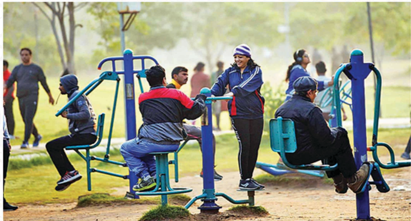
OPEN AIR GYM