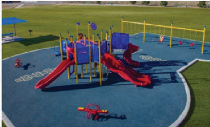
TODDLERS PLAY AREA

Daa Home Residency's provides a safe and secure kids play area in the society where kids develop crucial physical, social, emotiotnal and imaginative skills necessary to gain self-confidence, improve coordination, and advance critical thinking capabilities. It includes skating area for kids and toddlers playing area also.