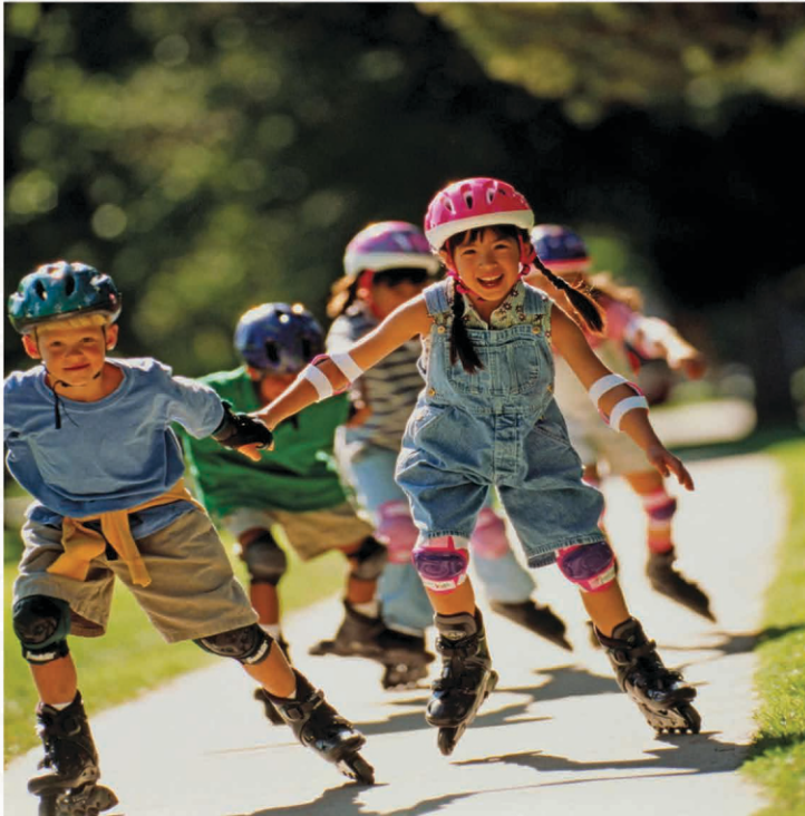
KIDS SKATING AREA