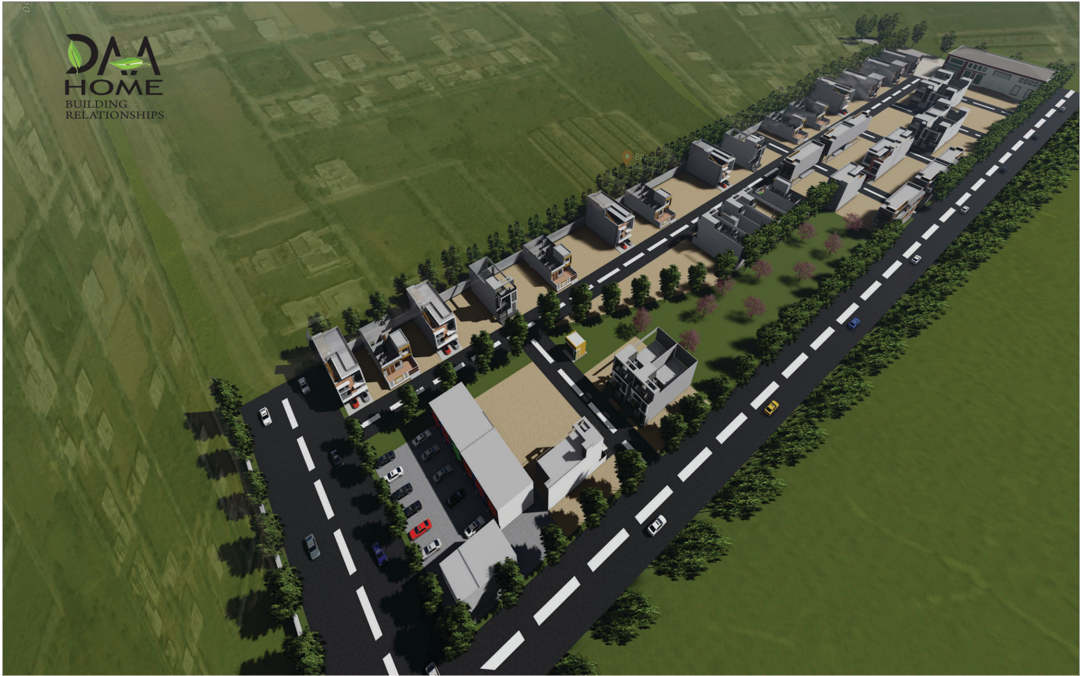
BIRD EYE VIEW OF DAA HOME RESIDENCY